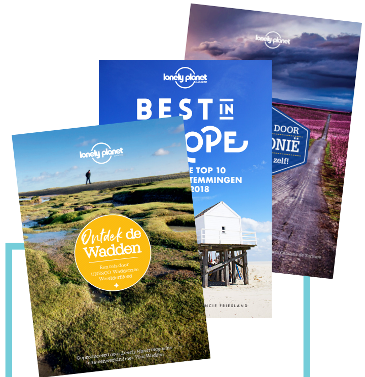
Custom branded content